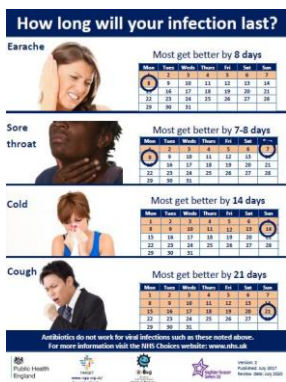
Managing your infections