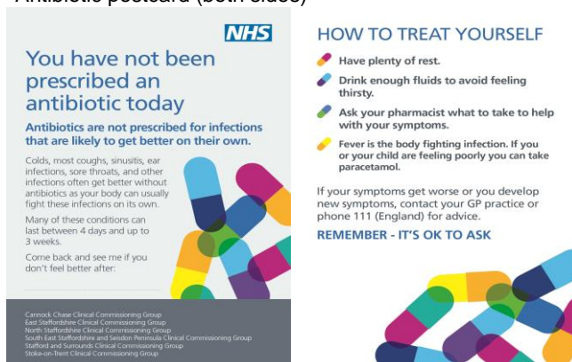
Antibiotic postcard (both sides)